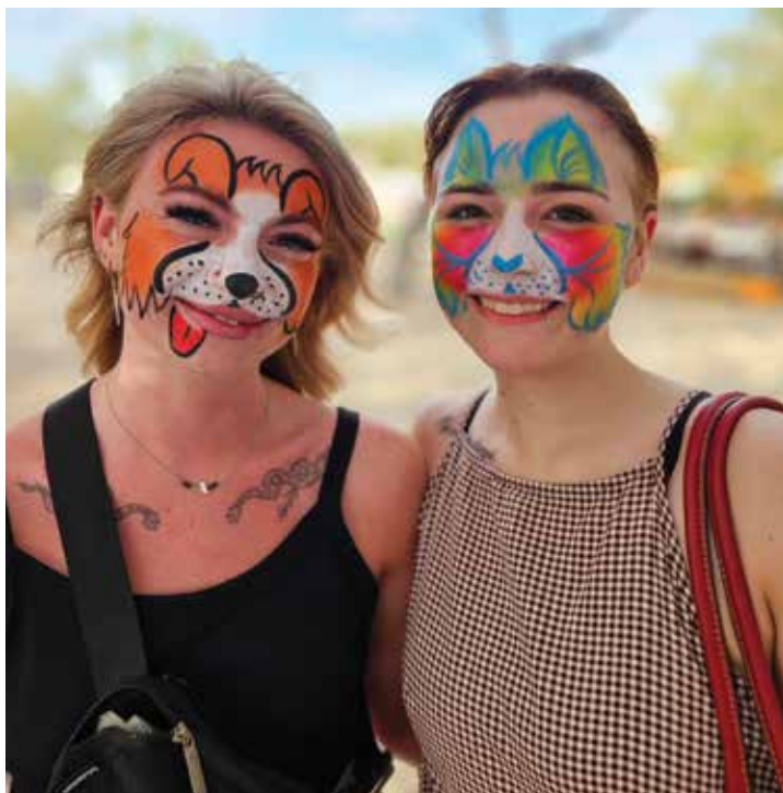
The Basics of Face Painting.

Location: Wamego United Methodist Church - MultiPurpose Rooms - Located Near Back Parking Lot Side Entrance Leading Directly to Classroom 600 Lincoln Ave, Wamego