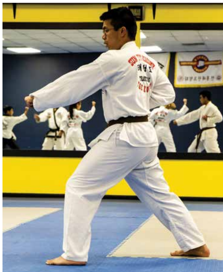
Tae Kwon Do student.

Location: Sun Yi Academy, 1125 Laramie Plaza, Suite H