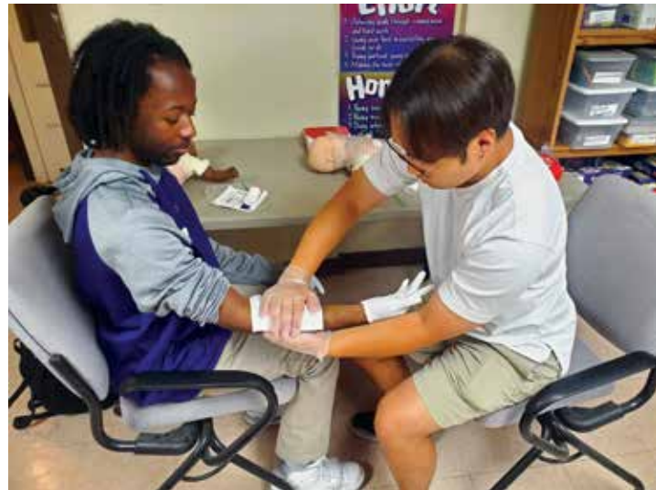
Students practicing First Aid/CPR skills.

Blended Learning is a CPR, First Aid, and AED training program that combines an online session with a hands-on skills practice and assessment session. Certification in Adult and Pediatric First Aid/CPR/AED is good for two years. You will be contacted via email by UFM staff with login information and directions. Certification requirements are as follows: Part I: Complete the online sessions by correctly answering at least 80% of the questions on the final exam, then provide proof you successfully completed the online portion at the hands-on skills practice and assessment session. Part II: Attend the in-person session and demonstrate competency in the hands-on skills practice and assessment session. Source: American Red Cross Classes are subject to cancellation if minimum is not met. Registrations are transferable to another Blended CPR class, or a refund will be provided. For more information visit tryufm.org .