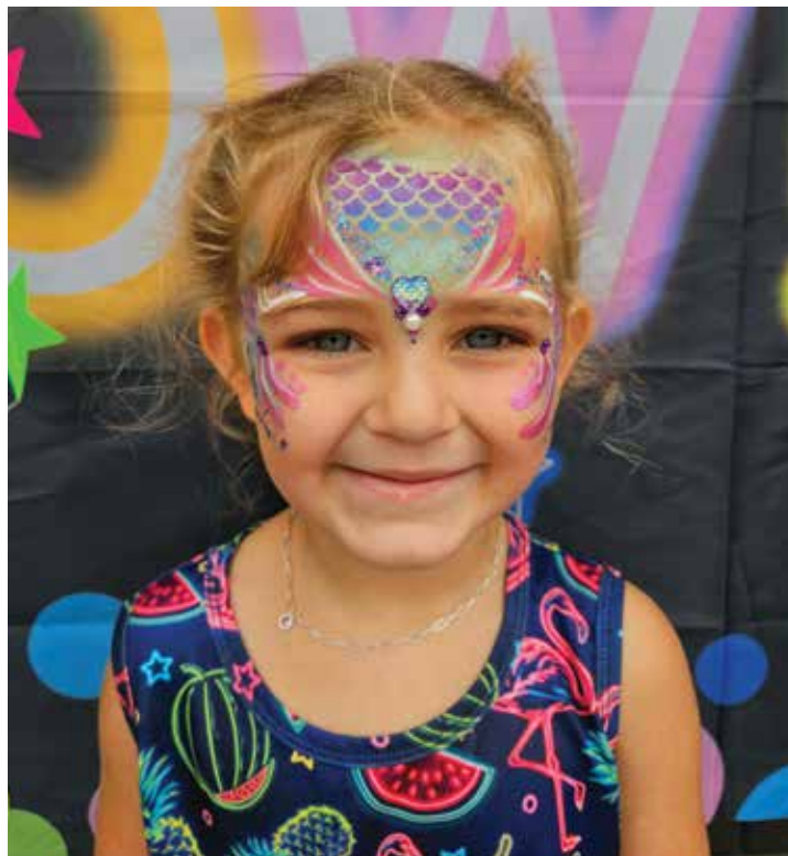
The Basics of Face Painting.

Location: Wamego United Methodist Church - MultiPurpose Rooms - Located Near Back Parking Lot Side Entrance Leading Directly to Classroom 600 Lincoln Ave, Wamego