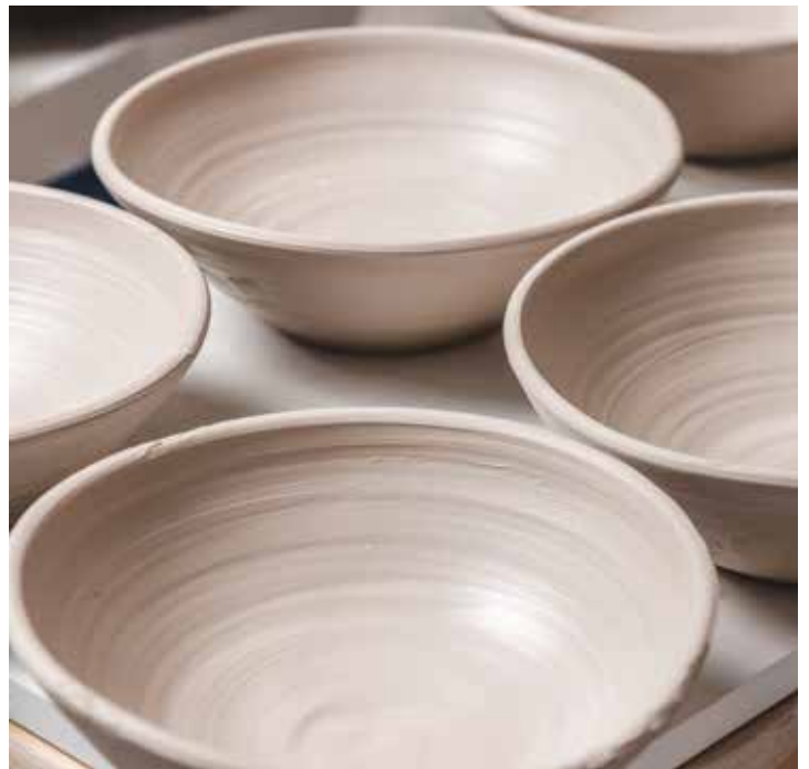
Final projects will vary by student.

Location: UFM Solar Ceramic Studio, 1221 Thurston St (Located in the Solar Addition, greenhouse building, next to UFM's main building, right off the parking lot.)